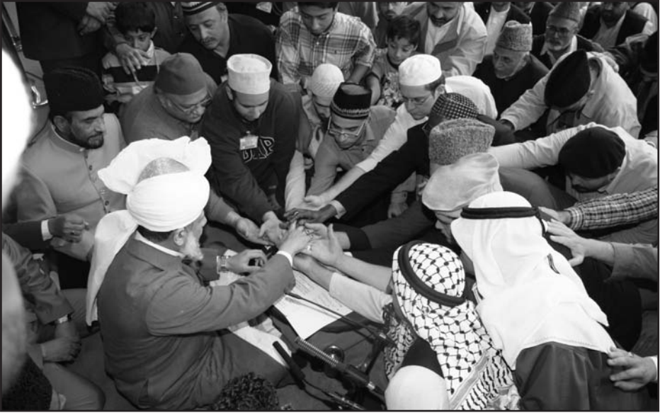
International initiation ceremony at the hands of the Hadhrat Khalifatul Masih V

and supremacy. He also said that we are fortunate to have the Khilafah amongst us. It is this rope of Allah to which we must hold fast.