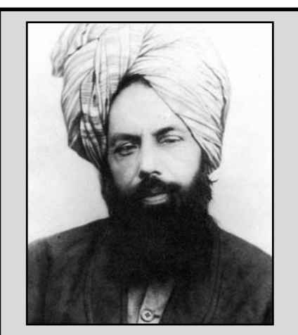
The founder of the Ahmadiyya Muslim community was Hadhrat Mirza Ghulam Ahmad<sup>(as)</sup>.

It cannot be established that at any particular time the whole of mankind collectively, or its different sections separately, had invented the different tongues that are spoken in the world. It may be asked why should it not supposed that, as God be Almighty constantly brings about changes in languages, in the beginning languages might have been originated in the same way without the need of revelation? The answer is that in the beginning God had created everything simply through His power. Reflection on heaven, earth, sun, moon and on human nature itself would disclose that the beginning and origin of everything was through the pure operation of Divine power, in which no physical means were involved. Whatever God created was a manifestation of His supreme power, which is beyond the concept of man .... The circumstances of today cannot serve as a precedent for the beginning and origin of creation.